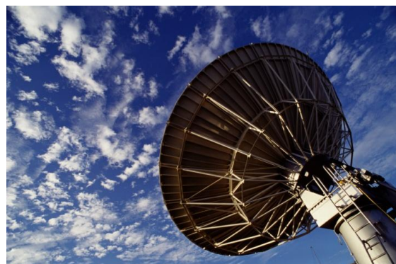
The Ultra-wideband ability of RFEL's ChannelCore Flex makes it ideal for Satellite communications

ChannelCore Flex is a major breakthrough as it provides the customer with the ability to extract from a very wide input signal any number of channels simultaneously in real time. These can be any combination of different bandwidths and sampling rates with any overlap and centre frequencies. Furthermore, each channel can be individually defined and changed as required so that the system designer can tailor a solution that precisely meets the needs of the application on a single FPGA.